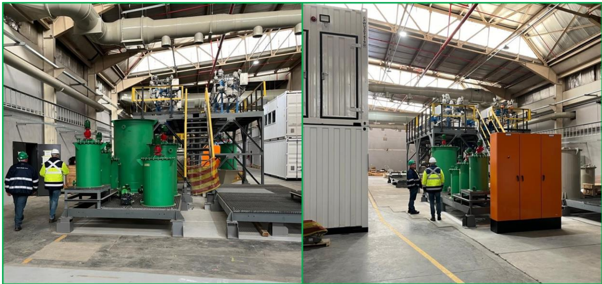
Figure 1A and 1B: Purification Process Modules 1 & 2

The Demo Plant will consist of nine Process Modules, each a self-contained process system within a fixed frame. An additional five of these Process Modules have been installed since the June update (see June 20, 2024 news release), see Figures 1A, 1B, 2, 4 and 5 below