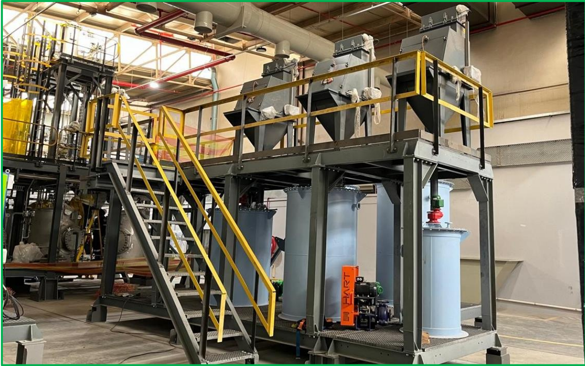
Figure 2: Reagent Make-up Process Module

The Demo Plant is at 1:10 engineering scale of the planned commercial plant in Kanye, Botswana (“ Commercial Plant ”). For example, the leach tanks have a 60cm diameter in the Demo Plant and this is expected to be 8-10x larger at approximately 5m in the Commercial Plant.