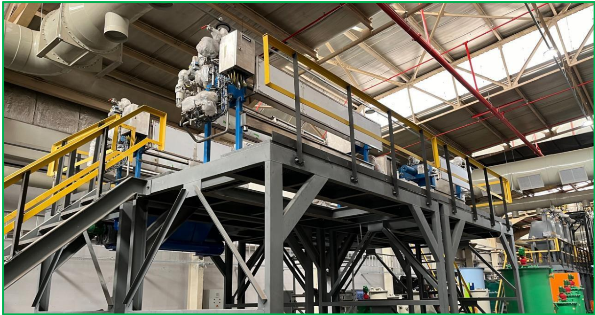
Figure 4: Filtration Process Module

Construction of Process Modules continues from the South end of the facility to the North. Once installed, Process Modules are completed mechanically, electrically and then fitted out with piping and instrumentation. After this, the initial stages of commissioning C1, C2 and C3 are undertaken at an individual Process Module level. Commissioning of the full process flow (C4 & C5) will only be concluded once all of the individual Process Modules are complete.