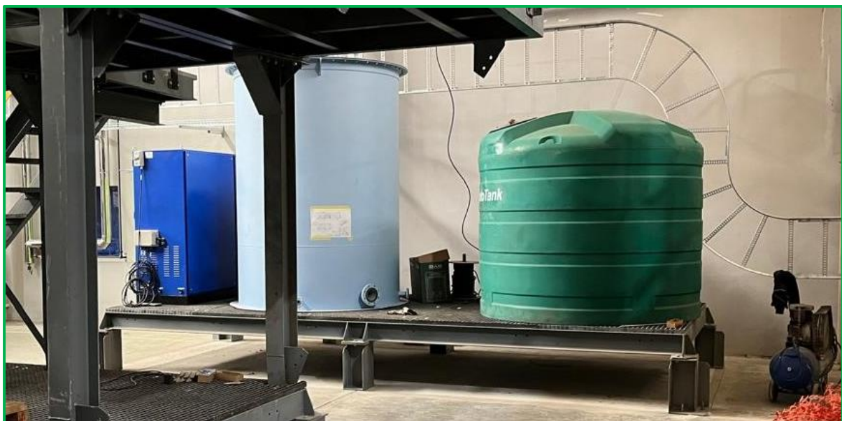
Figure 5: Water Treatment & Storage Process Module