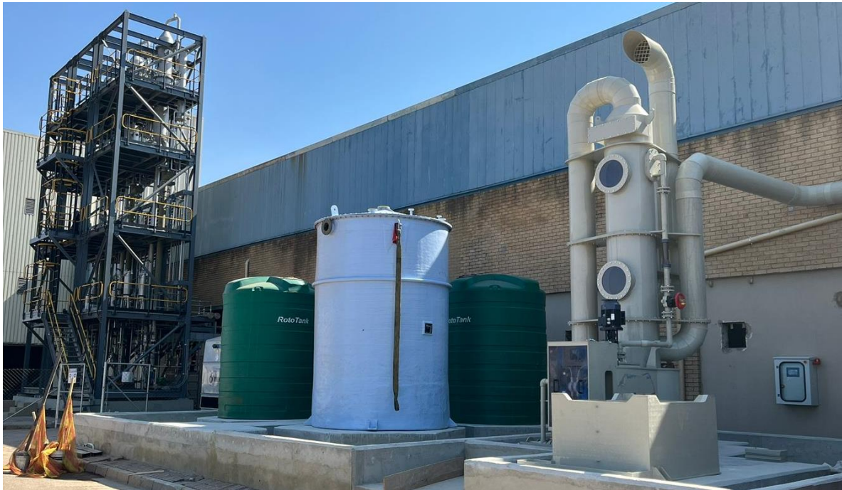
Figure 2: Waste Storage Area, with Scrubber in Foreground

Following the installation of the final two Process Modules, the leach reactors have been installed and all large components are now in place. This represents a significant construction milestone, as there are now no further heavy lifts to undertake.