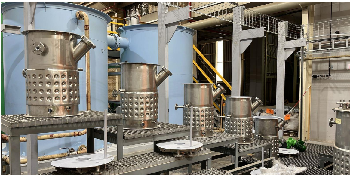
Figure 1: Leach Reactor Installation