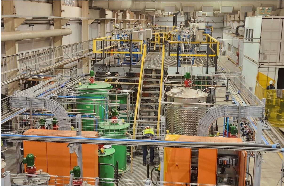
Figure 1: Demo Plant Overview Looking South

The results of this undertaking will yield significant strategic and operational benefits, and we look forward to providing further updates in due course."