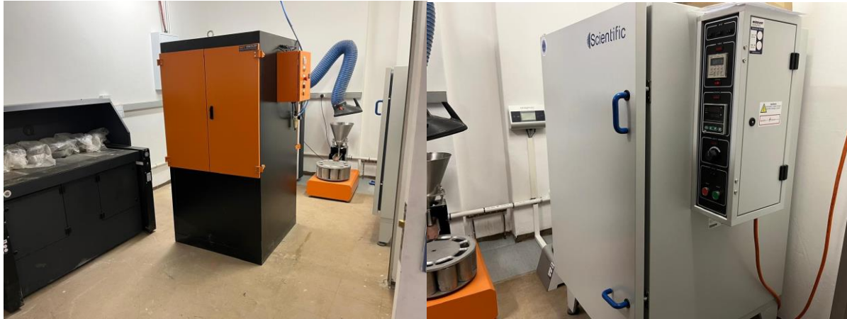
Figure 5: Onsite Independent Lab Preparation Area