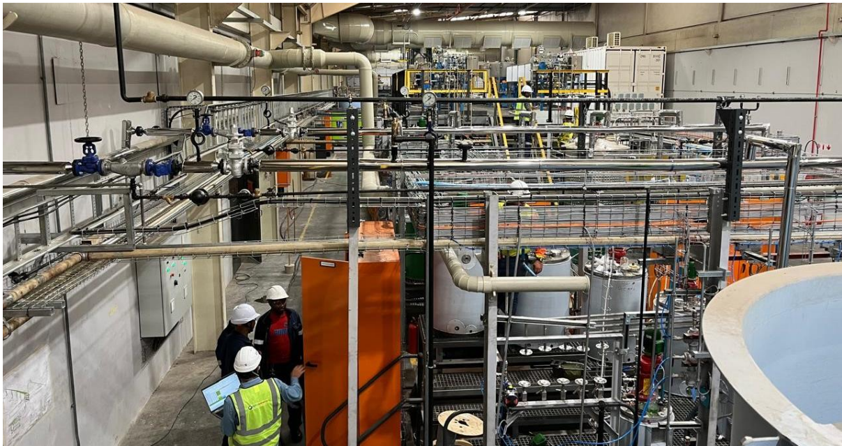
Figure 1: Demo Plant Overview Looking South