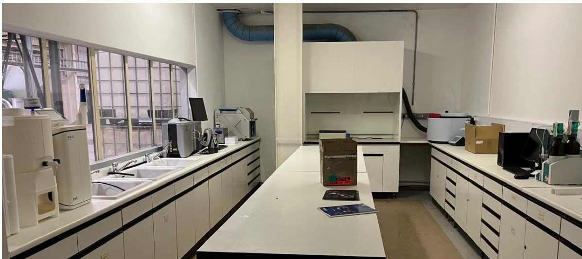
Figure 4: Onsite Independent Lab

In addition to progress at the Demo Plant, concurrent metallurgical test-work is underway to further optimize the flowsheet. Giyani is focussed on further reducing reagent use and improving both the operating cost and carbon profiles for the Commercial Plant, planned for construction adjacent to Giyani's extensive 100% owned manganese oxide ore sources in Southern Botswana.